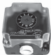
P233 Sensitive Differential Pressure Control