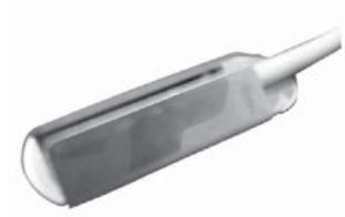
HX-9100 Dew point Sensor