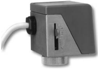
VA-7010 ON/OFF Terminal Unit Valve Actuators