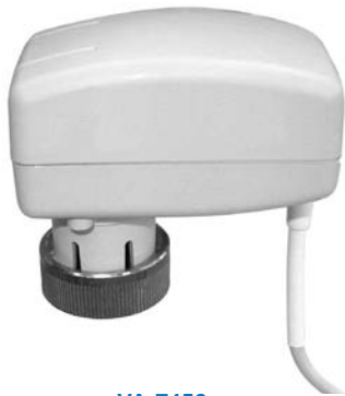
VA-7450 Thermal Proportional Actuators