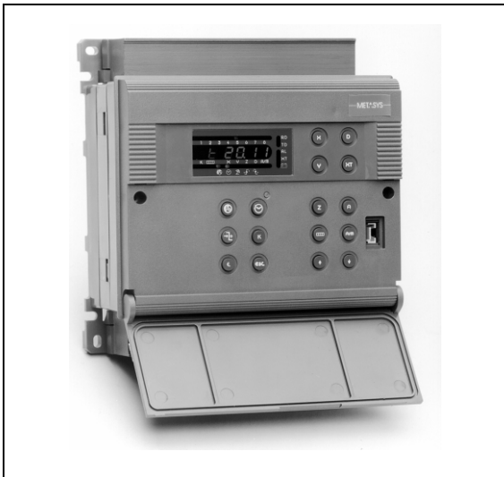
Figure 4: DX Controller with LED Display and Keyboard on Panel Mounting Base

The DT-9100 display unit is supplied with a panel mounting kit and a kit is available to enable the unit to be surface mounted, for example, on a wall. The display unit can also be used as a portable device, and a standard 230 VAC/12 VDC adaptor can be used to power it. A flexible cable is provided to connect the display unit to the DX-9100 controller.