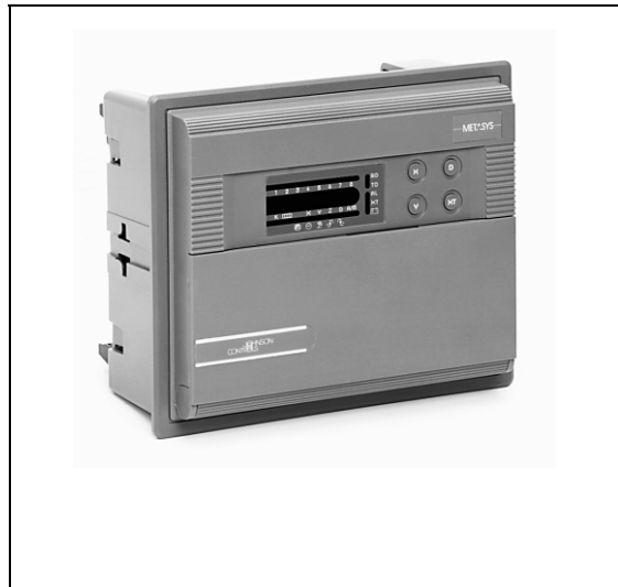
Figure 5: DX-9100 with LED Display and Keyboard in Cabinet Door Mounting Frame