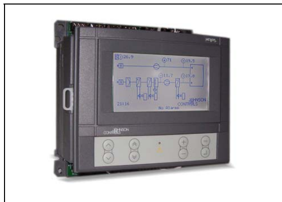
Figure 7: DX Controller with DT-9100 Display Unit on Panel Mounting Base