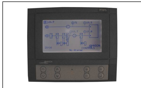
Figure 2: DT-9100-8204