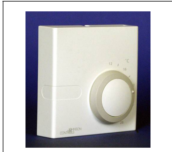
Figure 10: Room Temperature Sensor