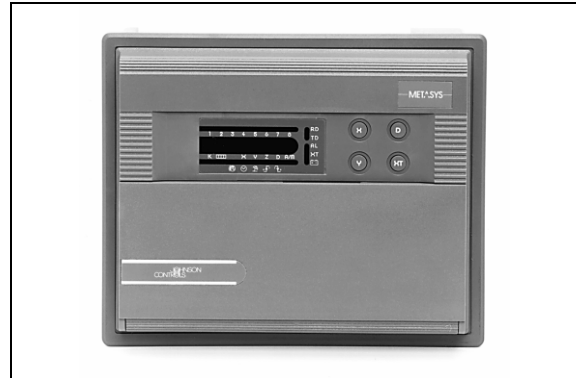
Figure 1: DX-9100-8454

When the DX controller is integrated into a Metasys® system, point and control information is available throughout the network and at all Metasys operator workstations.