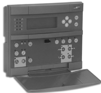
Figure 3: Large User Interface

The Large User Interface (LUI) includes a 4 x 20 character, backlit LCD, 28 pushbuttons, and 66 discreet status LEDs. The Large User Interface must be independently powered, and can be flush mounted, wall mounted, or hand held. The LUI display and navigation is completely customizable for the FX15 application using the FX Tools software package. Custom front plate templates may be ordered, based on minimum quantity.