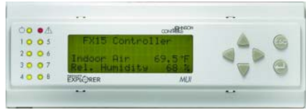
Figure 2: Remote or Local MUI