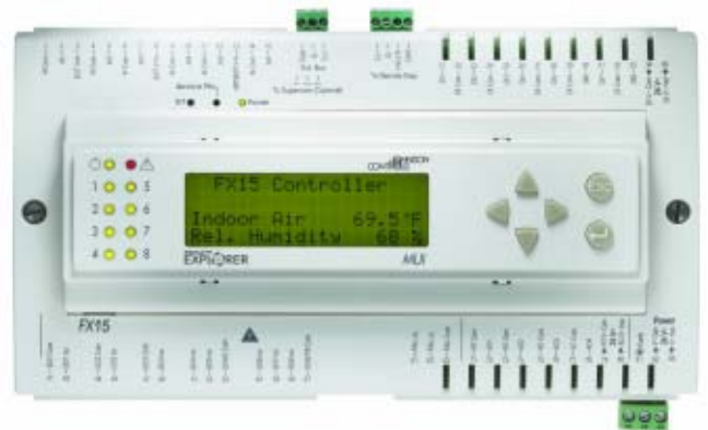
Figure 1: FX15 with Integrated Medium User Interface (MUI) Display

The FX15 also includes an onboard Real-Time Clock to support the start-stop scheduling of equipment and real-time based control sequences.